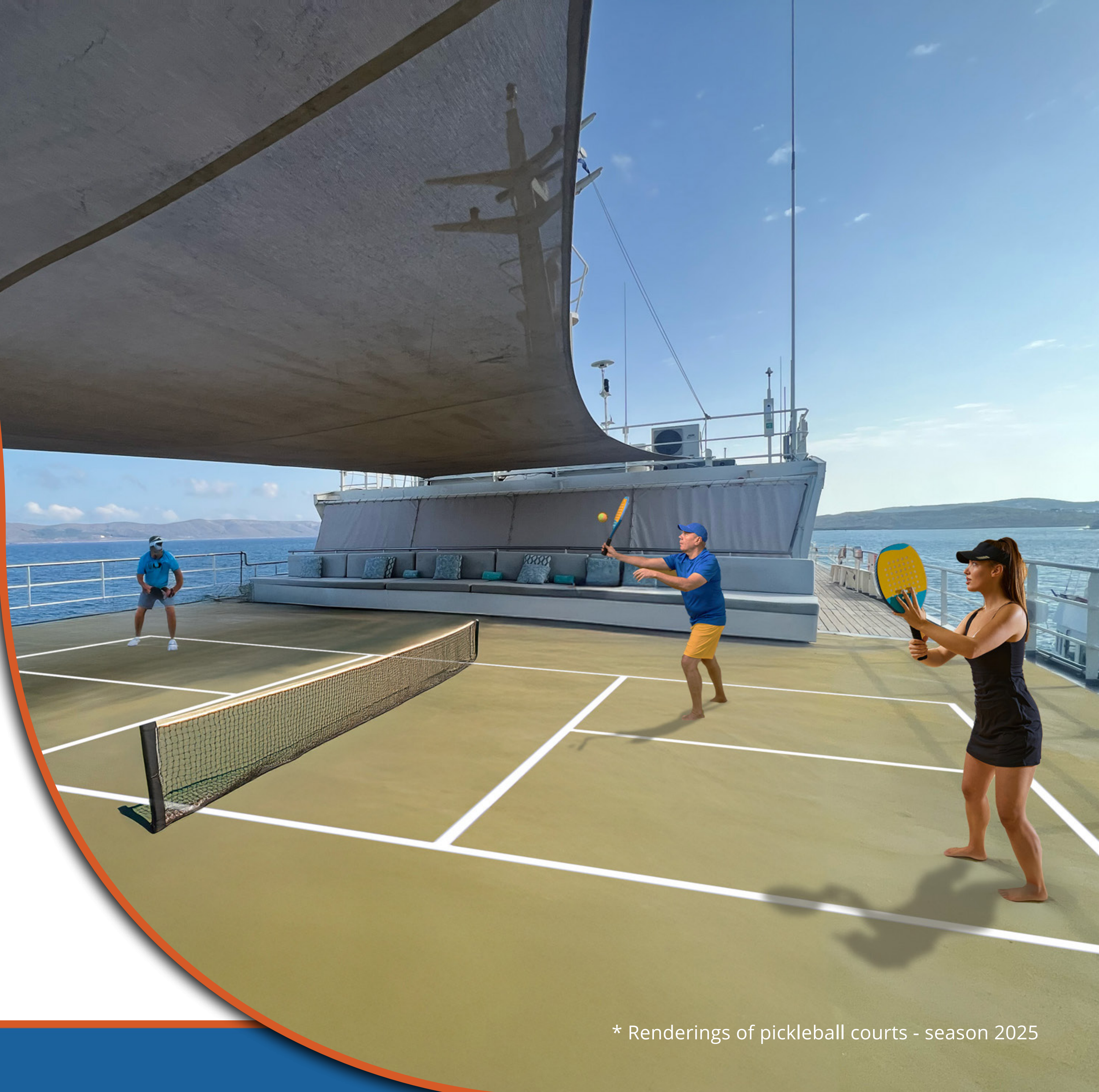
Upper Cabin Deck Astra